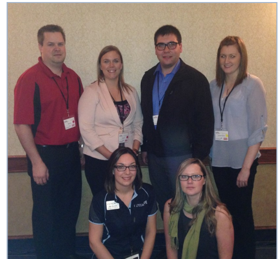
Credit Union Young Leader of Manitoba 2015 Conference