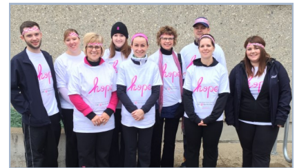
CIBC Run For The Cure