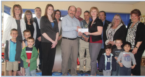
Park West School Division Early Years Program Sponsorship Presentation