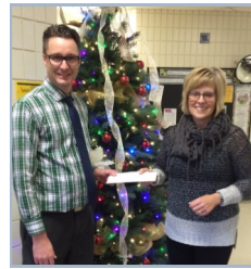
Betty Gibson School Annual Christmas Dinner Sponsorship