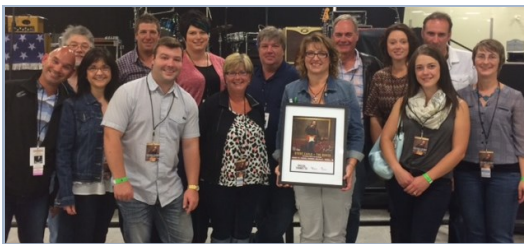
Steve Earl Concert Sponsorship in support of Cancer Care, Russell & Area

Charitable: Alzheimer Society, Arthritis Society, Brandon & Area Women of Distinction, Canadian Breast Cancer Society, Canadian Cancer Society, Canadian Diabetes Foundation, Cancer Care Manitoba, Cerebral Palsy Association, CIBC Run for the Cure, CNIB Foundation, Co-operative Development Foundation, CURE Foundation, Juvenile Diabetes Research Foundation, Journey for Sight, Manitoba Lung Association, Manitoba Women of Distinction, Manitoba Women's Institute, MS Society, United Way - Brandon & District, YWCA Foundation